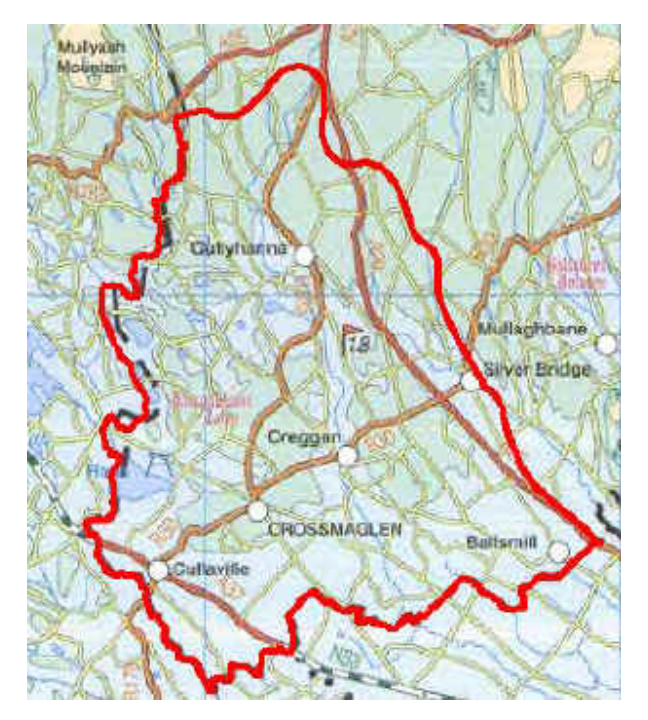
3.2.5 LCA 70 - Crossmaglen Drumlins and Loughs

The landscape is generally in good condition, especially in the drumlin farmland landscape to the north. It becomes slightly more degraded on the fringes of Newry, with field boundaries falling into disrepair and scattered ribbon development. Pylons, major transport corridors and insensitive development associated with the town, serves to detract from the overall high quality of the landscape. The most sensitive landscapes are the attractive river valleys, loughs and marshes, such as the Derryleckagh Bog ASSI and the many archaeological sites (raths, mottes, standing stones), which are concentrated on the fringes of the area.