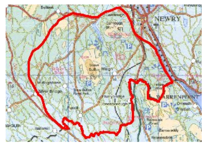
This map is reproduced with the permission of Ordnance Survey (NI), © Crown Copyright