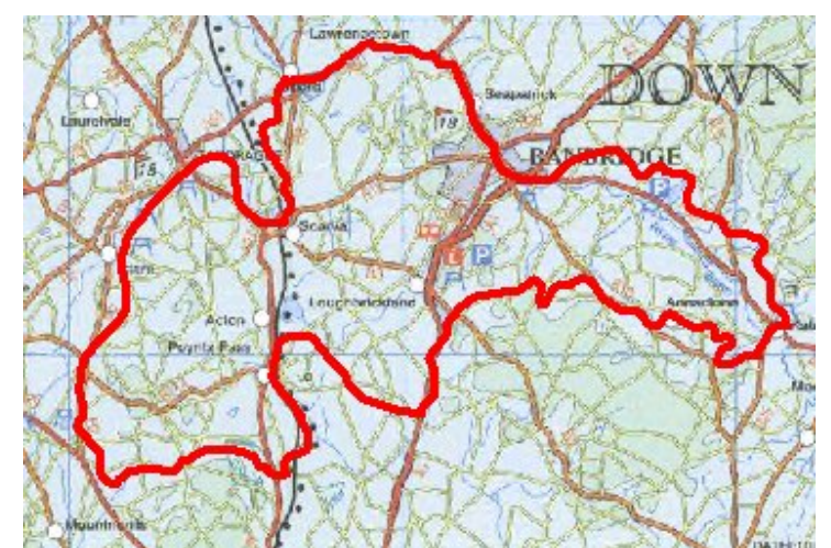
This map is reproduced with the permission of Ordnance Survey (NI), © Crown Copyright