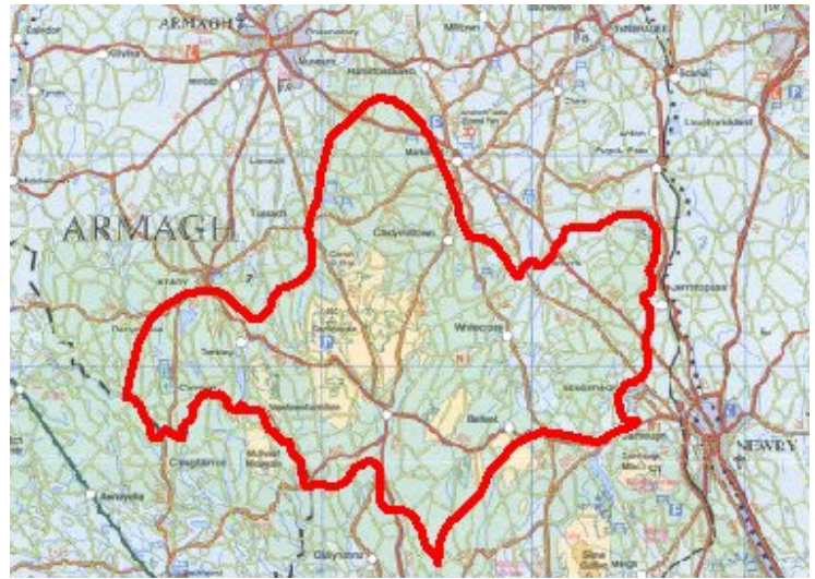
This map is reproduced with the permission of Ordnance Survey (NI), © Crown Copyright